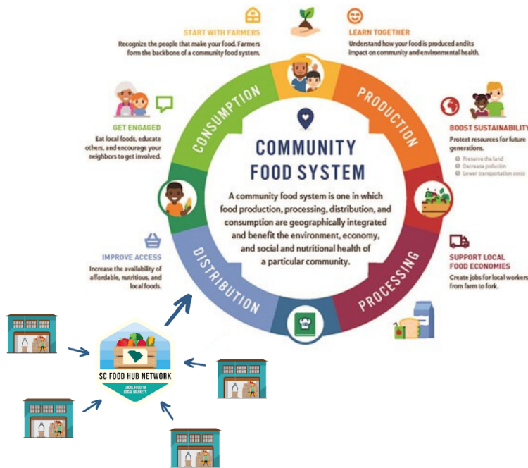
Community Food Systems Graphic (USDA)

It is not the intention of this report to act as a full strategic plan or as a complete operational document but rather provide a catalyst in continuing the growth and support of South Carolina’s local food system. The report recommendation goals are two-fold: strengthen and expand local food capacity and increase visibility and viability of South Carolina small farms. The recommended activities to achieve these goals are as follows: 1) Establish and sustain a local food system network for the state 2) Increase collaboration among local food stakeholders 3) Provide leadership development for local food advocates 4) Build capacity for the South Carolina Food Hub Network and 5) Develop, gather, and organize key metrics and resources.